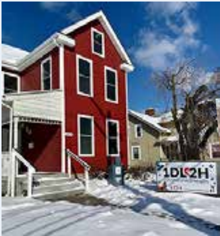
Wayne Ave. and Sullivant Ave.