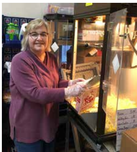
Preparing popcorn in the storage room.