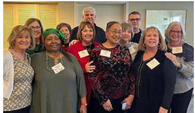
Class of 1973