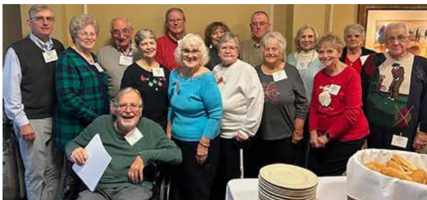
Class of 1963