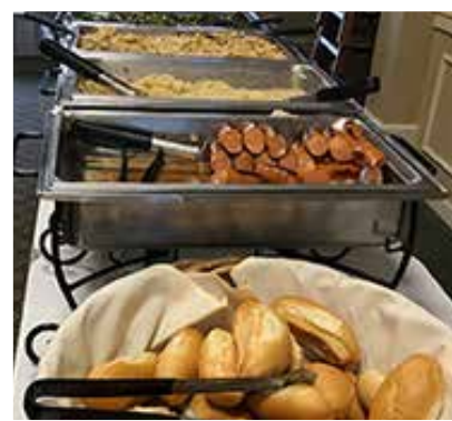
German Feast at Schmidt's